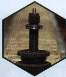
SAE 8620 Gearing & Shafting