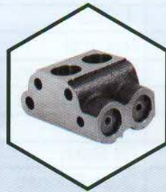
Forged Heavy Duty Hydraulic Chamber Body