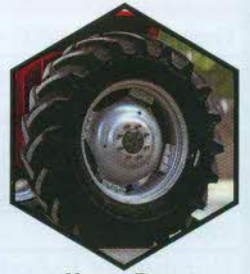
Heavy Duty General Brand Tyre and Rims