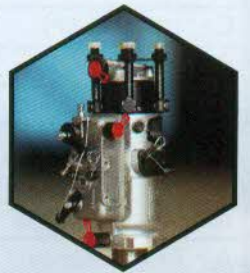
Fuel Efficient Original Delphi Brazilian Pump and Injector