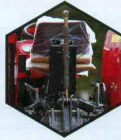
Heavy Duty Top Link