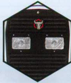
High Lux Crystal Head Lamps