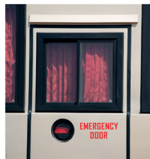
Rear Emergency exit