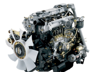
4D34 Diesel Engine, 3907cc Output 136HP Torque 38 kgm