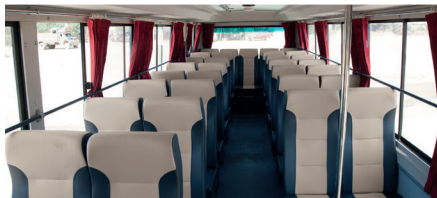
Luxurious interior design with sound insulation to provide pleasant travelling experience for passengers.